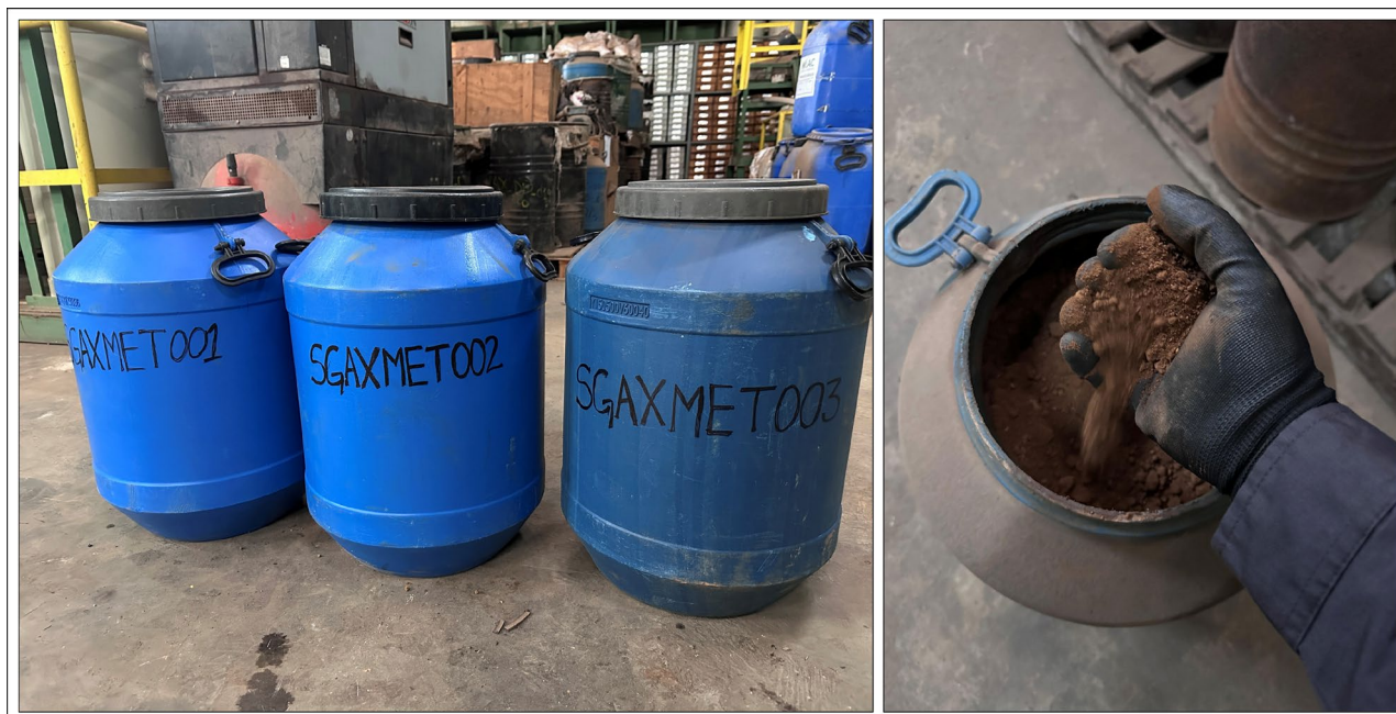
Figure 2: Selected samples for metallurgical bench-scale testwork being prepared for dispatch.

The Parent Holes returned assays with grades in the range of 1.6% to 2.9% niobium pentoxide ( \text{Nb}_2\text{O}_5 ) and 8.4% to 14.2% Total Rare Earth Oxides (TREO) – see Table 2. For details of the historical drilling and assays, see our ASX Release dated 6 August 2024 'Acquisition of High-Grade Araxá Niobium Project'.