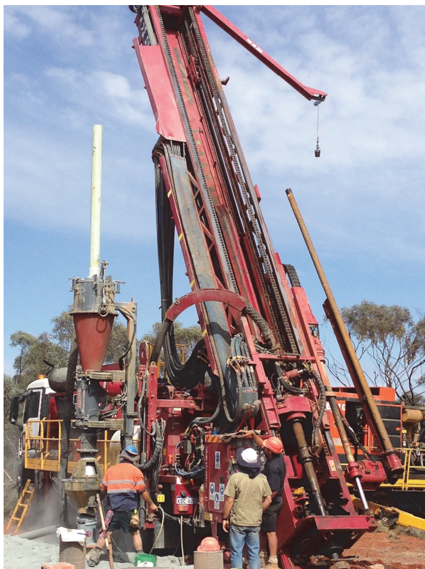
Figure 2 – Drill rig at hole WINRC014

The drill rig will remain available to return to Windsor for drill testing of any conductors identified in the DHEM surveys.