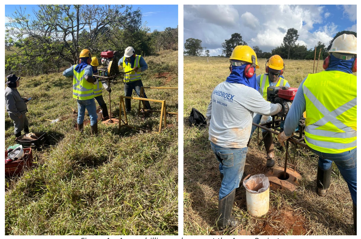
Figure 4 – Auger drilling underway at the Araxa Project.