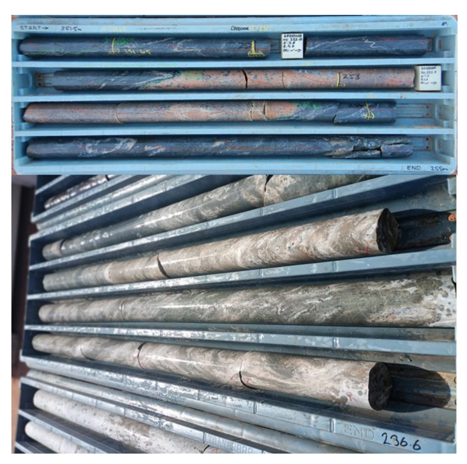
Figure 1: Core from PDD006 (top) and PDD007 (bottom). PDD006 shows large potassic altered granite dyke cross-cutting sediment package and PDD007 showing chlorite altered carbonate sediments with disseminated sulphides (see Table 2). Assays are pending.

As with previous completed drill holes, the drill core for the latest holes shows locally intense alteration and hydrothermal veining with multiple zones of sulphides. These features are evidence of hydrothermal and mineralising processes and support the potential for mineralisation occurring within the Paterson Project. In particular, the thick carbonate rich sediments noted in PDD007 (Figure 1) may provide a favourable depositional setting for gold-copper mineralisation and are highly encouraging.