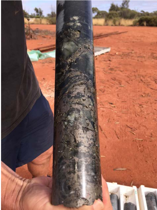
Figure 3 – brecciated massive sulphides at 135m downhole in WINDD012