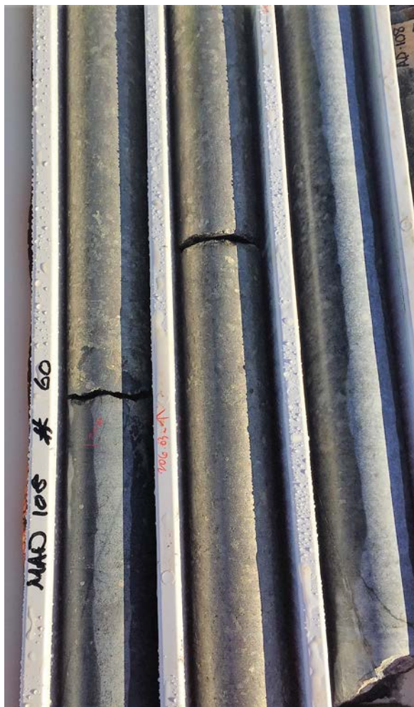
Figure 2 – Drill core tray from MAD108 showing the massive sulphides intersected between 206.03m to 207.3m downhole with average XRF readings of 8%Ni and 7%Cu.

From 207.3m to end of hole at 250m, further sequences of granite and pegmatites were encountered.