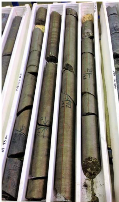
Figure 3 – drill core from MAD104 with massive nickel-copper sulphides. Interval shown returned assays of 3.34m @ 3.01%Ni, 1.12%Cu, 0.20%Co and 1.41g/t total PGEs from 70.11m.