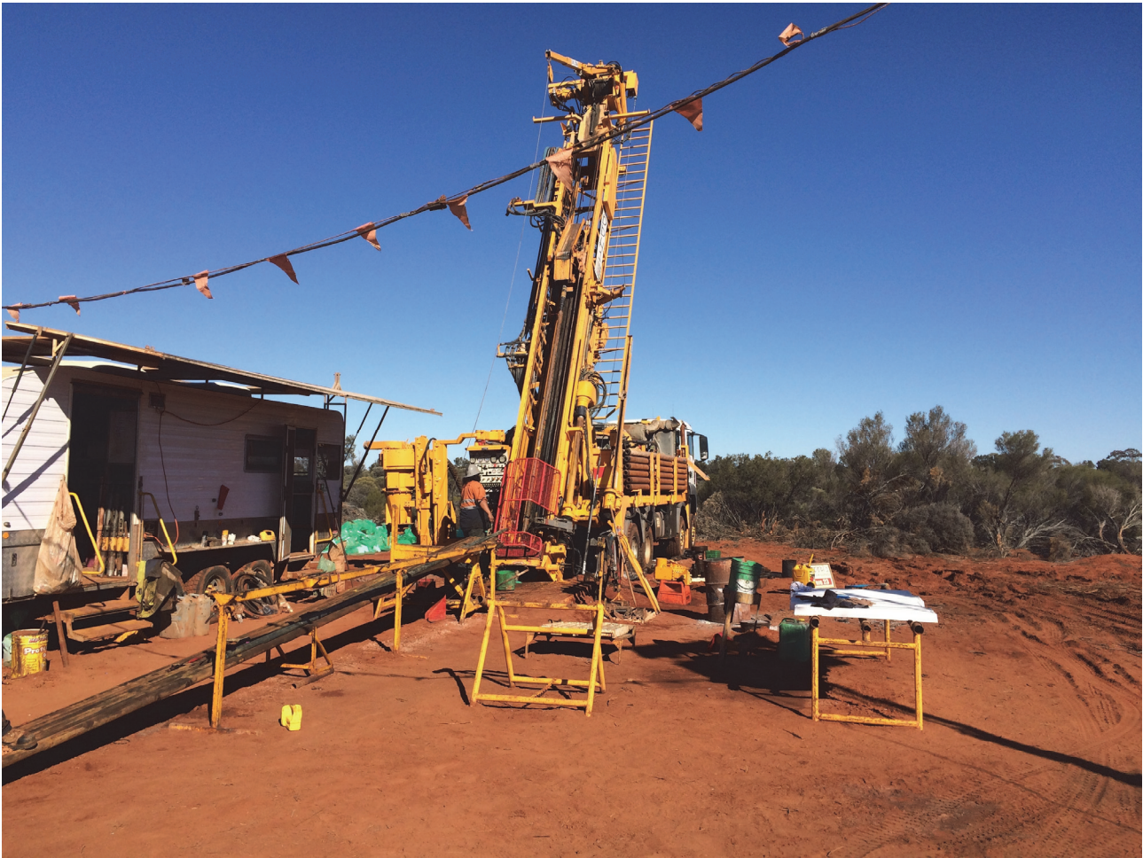
Figure 3 – drill rig at Desert Dragon