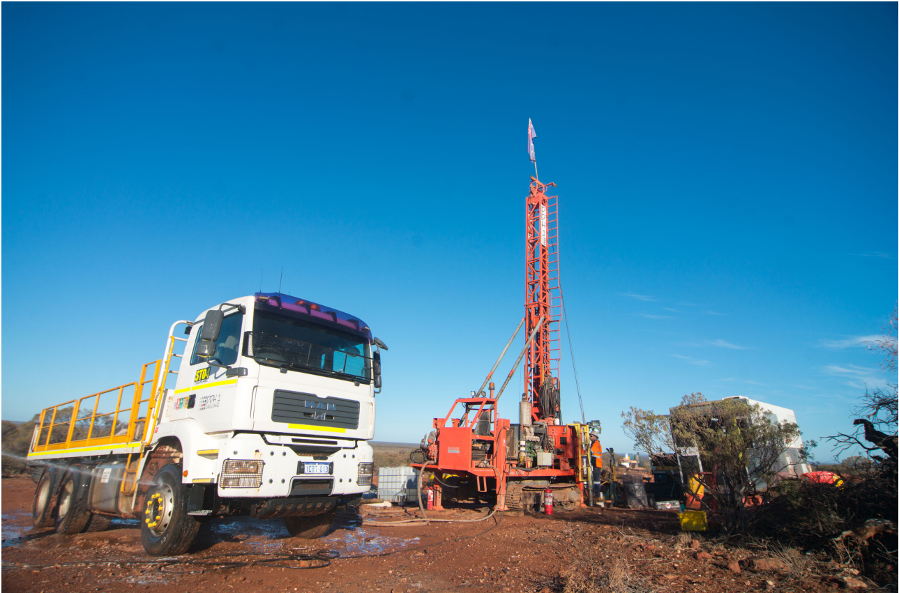
Above: photograph of diamond drilling underway at the Stricklands Prospect.

Authorised for release by the Board of St George Mining Limited.