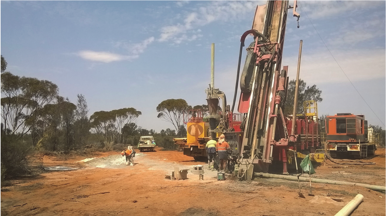
Figure 3 – drilling at the Windsor prospect