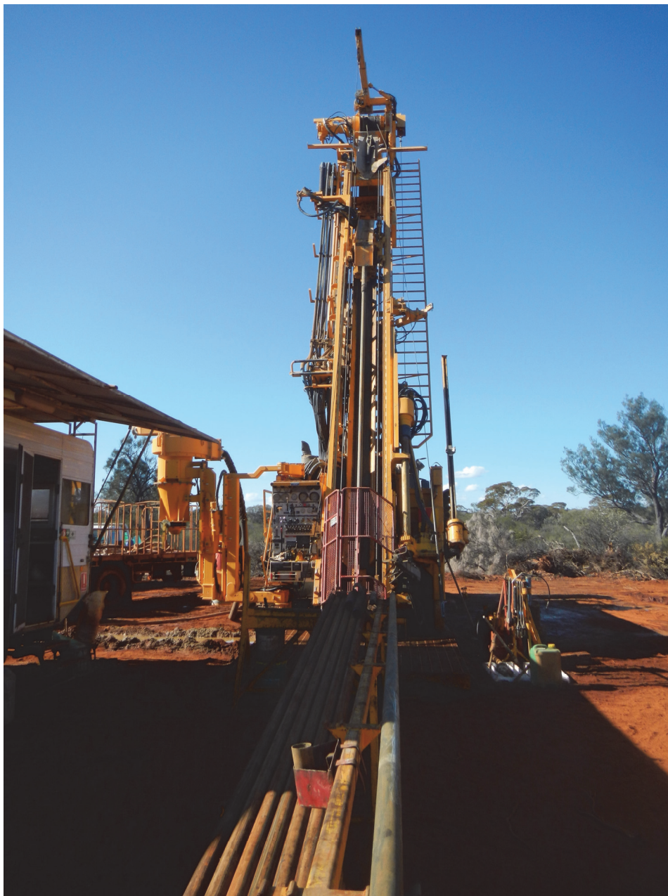
Figure 2 – drill rig at Cambridge, located in the northern part of the Project area where weather conditions have been good.

Drilling at the Aphrodite prospect, initially scheduled to occur after the drilling at Cambridge, has been deferred. Recent storms in the south of the Project area, where Aphrodite is located, have resulted in a deterioration of access tracks. Weather conditions are now fine, and we expect the access tracks to be in good condition by the end of this week. Drilling at Aphrodite, where the very strong 'Aphrodite 4' EM conductor will be tested, will be scheduled as soon as practicable.