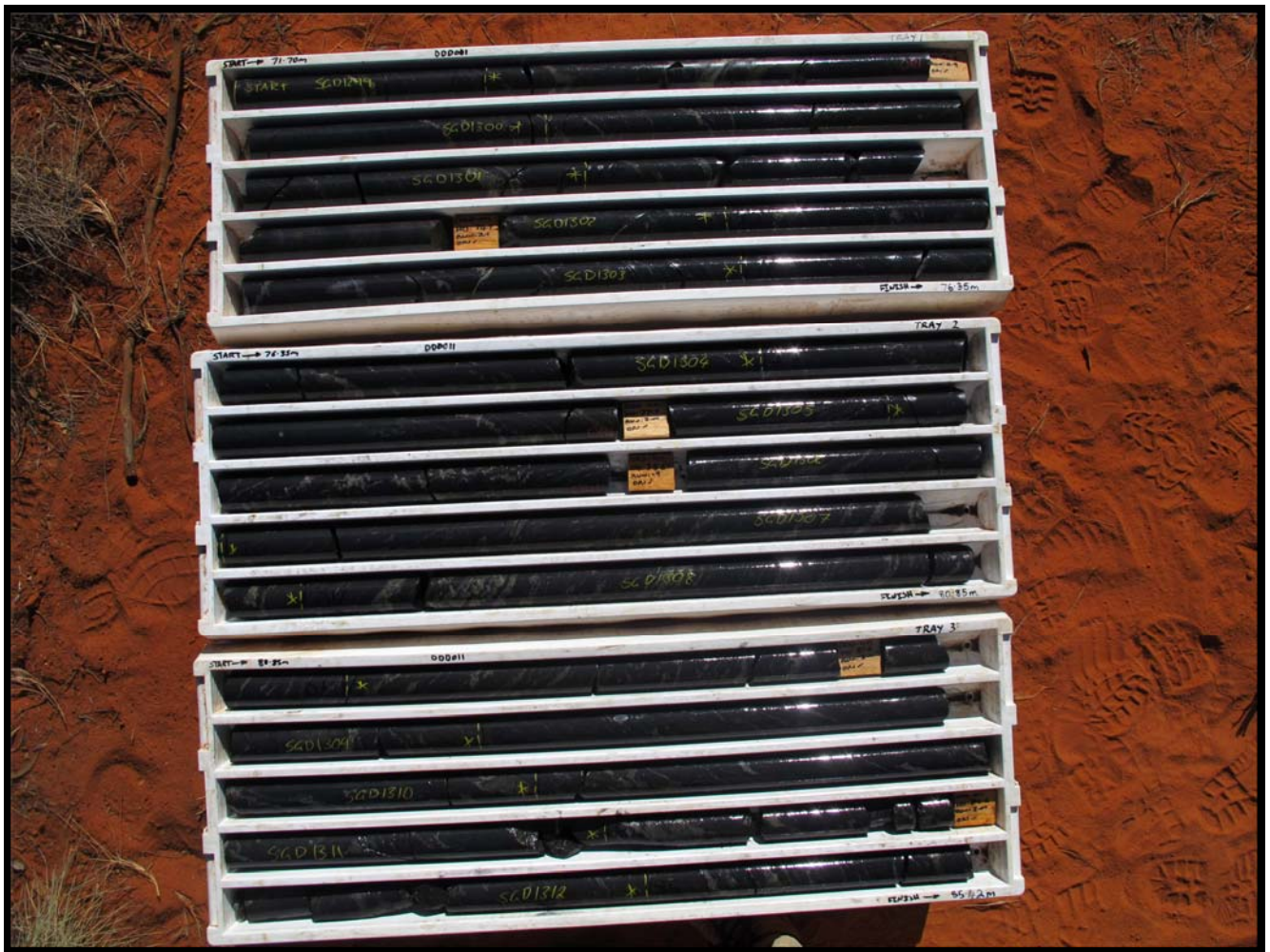
Figure 3 – Core (wet) from DDD011 that contains the Zn-Cu mineralised zone. The sulphide bands are visible in the core.

“We have always viewed the East Laverton Property as a unique mineral field with potential for numerous types of mineralisation, including nickel, gold and base metals.