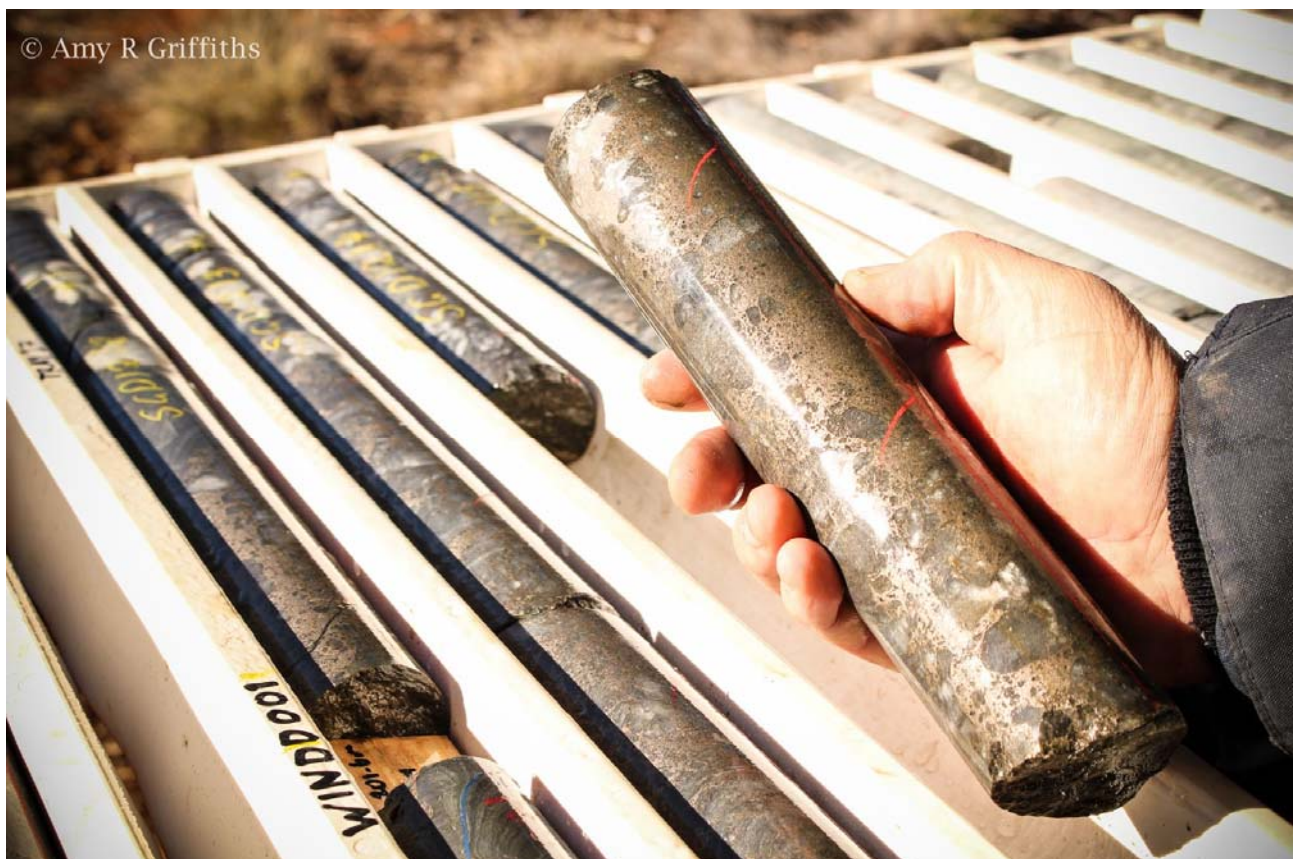
Figure 2 – Massive sulphides from diamond core at WINDD001

“This is extremely encouraging and re-affirms the potential for East Laverton to host significant massive nickel sulphides.”