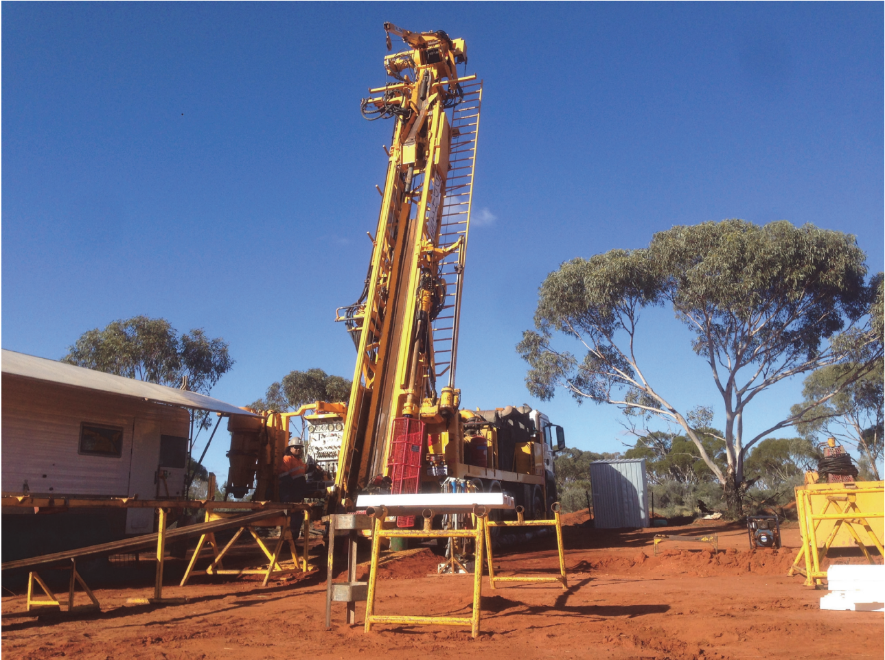
Figure 2 – photo of the diamond rig (DDH1 rig No. 23) taken this morning. The rig is at Desert Dragon Central, drilling hole DDRDD0009 to test DDRDD0005-DHEM2 (61,148 Siemens)