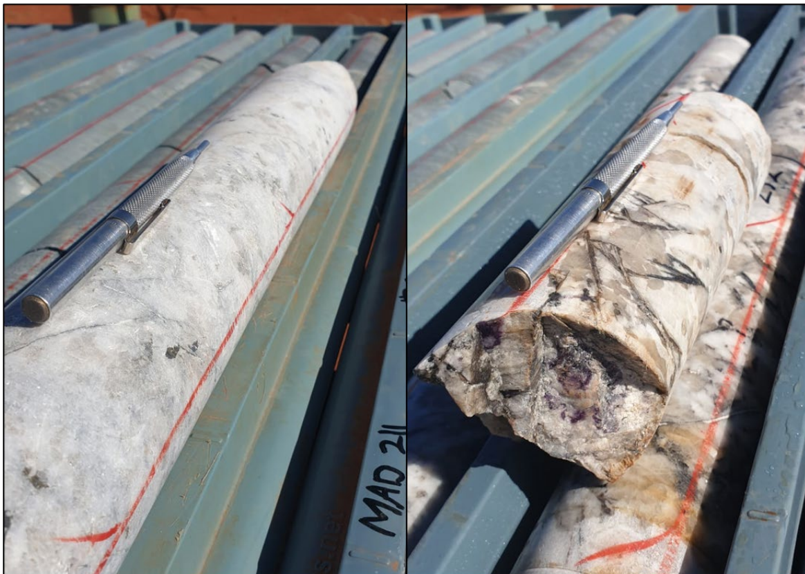
Figure 2 – drill core from MAD 211 showing pegmatite with lithium-bearing minerals. MAD211 intersected six pegmatite intervals that comprised 17.2-18m, 27.6-29.11m, 140.8-143.2m, 230.68-232.4m, 247.75-249.85m and 261.3-262.3m

The 2023 drill programme is scheduled to commence in the final week of February. A further announcement outlining drill targets will be made prior to the start of drilling.