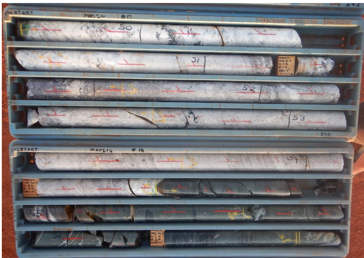
Figure 1 – photo of drill core from MAD214 which intersected 5m of pegmatites from 49.5m downhole.

The second batch of rock chip assays comprised 79 samples. Assays showed elevated levels of pathfinder elements including a low K:Rb ratio that is indicative of fractionated pegmatites that are prospective for lithium mineralisation. For further details of these rock chip samples see our ASX Release dated 21 December 2022 More Positive Lithium Results at Mt Alexander .