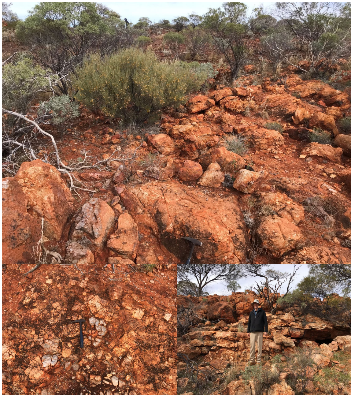
Figure 1 – photos of pegmatite outcrop at Mt Alexander. Rock chip sampling has confirmed a geochemistry favourable for the presence of lithium pegmatite mineralisation.

“The lithium opportunity at Mt Alexander is a perfect complement to our nickel sulphide discoveries at the project, and expands our focus on EV and clean energy metals.”