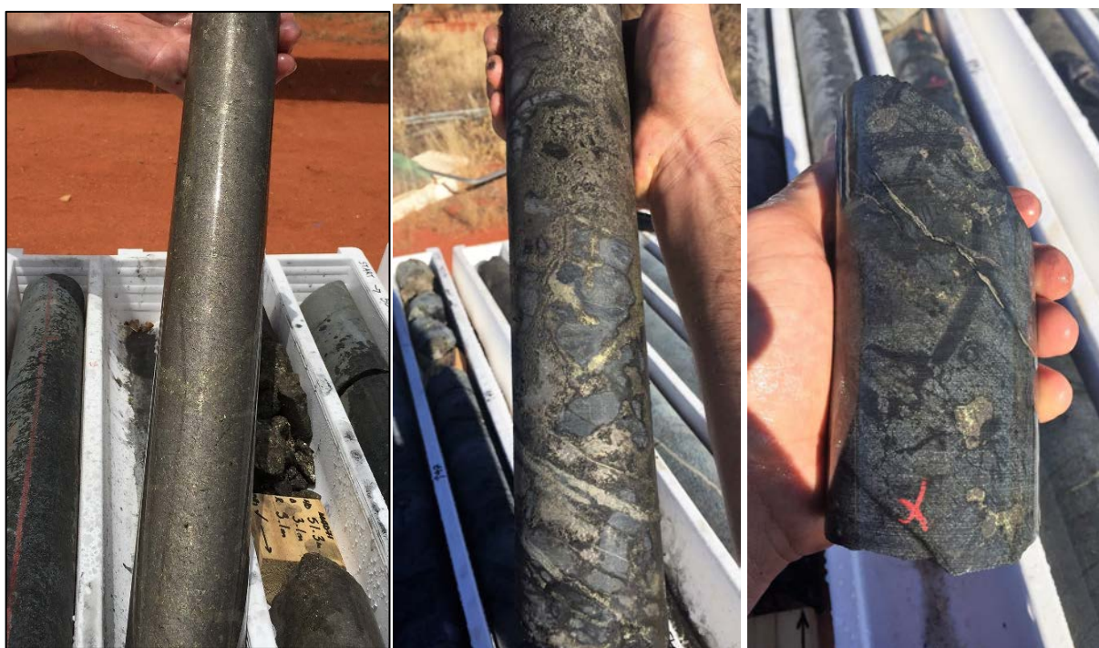
Figure 1 – Above left : drill core from MAD71. The section of drill core is from the massive sulphide interval that returned assays of 2.02m @ 5.05% Ni, 2.01% Cu, 0.21% Co and 3.31g/t total PGEs from 50.6m.

This kind of mineralisation was also intersected in MAD77 and supports the potential for further nickel-copper sulphides within the Stricklands mineral system.