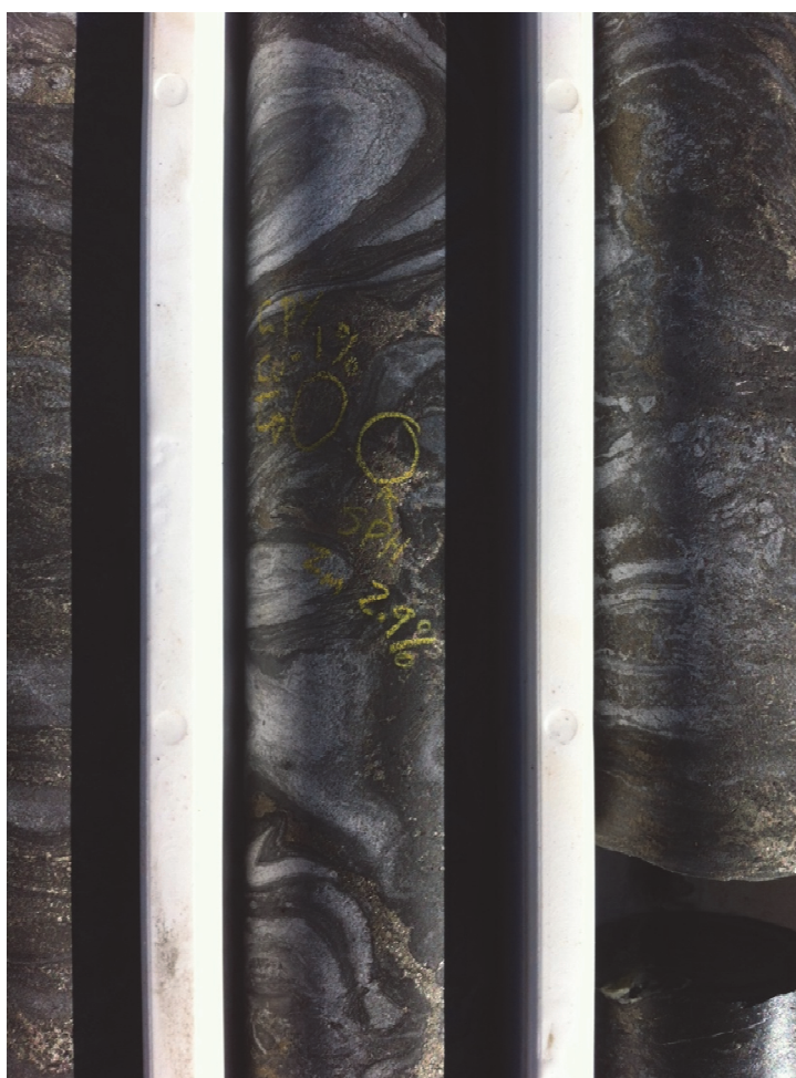
Figure 2 – a photo of drill core from DDRDD0005 at approx. 296m downhole. Chalcopyrite and sphalerite are visible in this sulphide rich interval. XRF analysis returned spot values of 2% Cu and 2.9% Zn. The widespread base metal mineralisation encountered by drilling supports the growing potential for major VMS-style mineralisation at East Laverton.

A number of high quality targets are situated in this eastern section and remain to be tested, including the powerful Dragon 9 EM conductor. Dragon 9 is situated on the eastern contact of a high-MgO komatiite channel at Desert Dragon Central and within a prominent fold of the Stella Range belt. This is a favourable structural setting for concentrating nickel sulphide mineralisation.