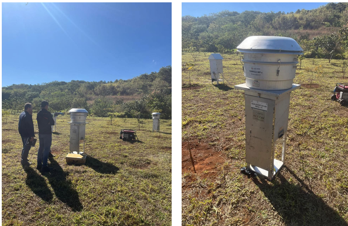
Figure 2 – Photos of stations for air quality monitoring at the Araxá Project.

The efficient completion of this environmental study work underpins to expedite permitting of a potential mining operation.