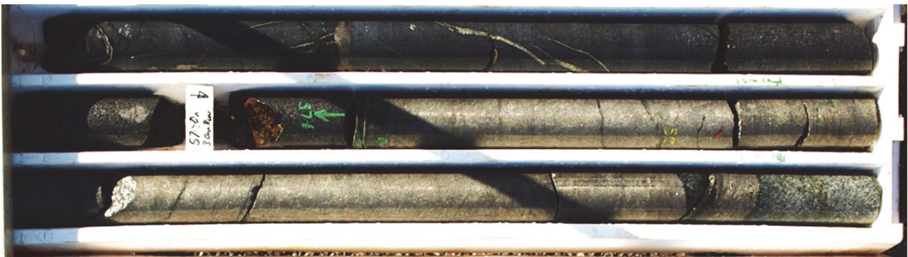
Figure 2 – high grade nickel-copper sulphides in ultramafic on contact with granite in MAD13 at Cathedrals. The interval highlighted in this photo recorded 1.4m @ 7.1%Ni, 3% Cu and 4.2g/t PGEs from 57.6m. There is strong potential for further intersections of high grade mineralisation in the 2016 planned drilling at Mt Alexander.

3D geological modelling of Cathedrals and re-logging of drill core is also in progress. The results of the 3D modelling are being used to assist with drill planning, and also to identify any continuity of massive and disseminated nickel-copper sulphide mineralisation in the Cathedrals ultramafics. Results from these reviews will be announced shortly.