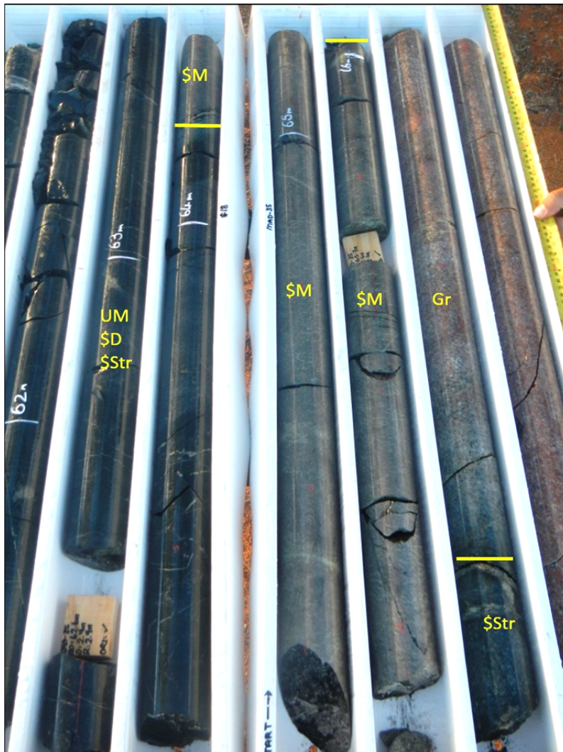
Figure 2 – MAD35 mineralised intersection, comprising ultramafic with disseminated and stringer sulphides then 1.86m of massive Ni-Cu sulphides (8.3%Ni, 3.6%Cu with XRF) and stringer sulphides on contact with an altered granite.

An additional drill hole, MAD36, was completed at Cathedrals to a downhole depth of 219.8m. This drill hole was designed to test an off-hole EM conductor identified by the DHEM survey in MAD19.