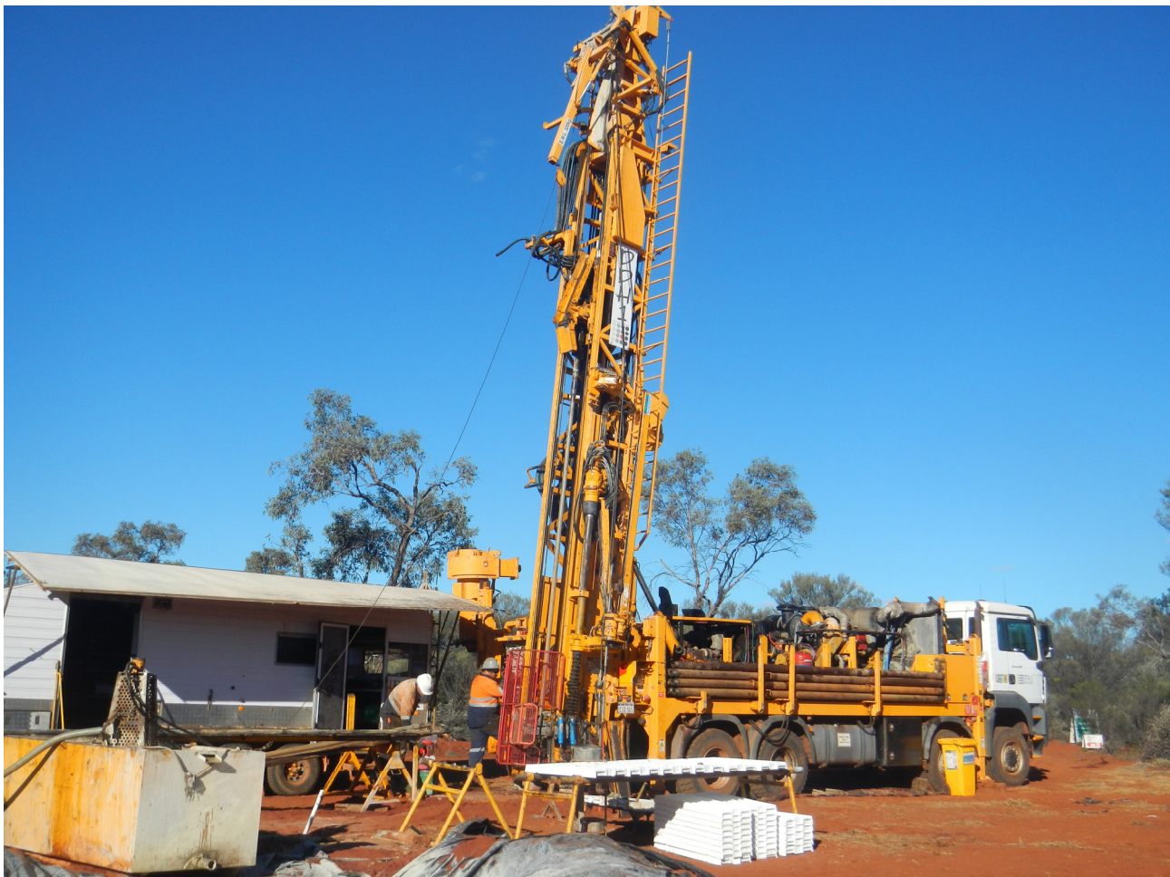
Figure 3 – drill rig at the Investigators Prospect where drilling of EM targets is underway