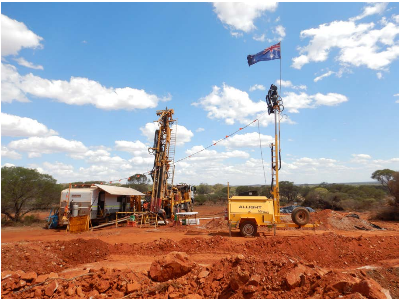
Figure 2 – photo of the drill rig at Stricklands (taken on 29 November 2017)