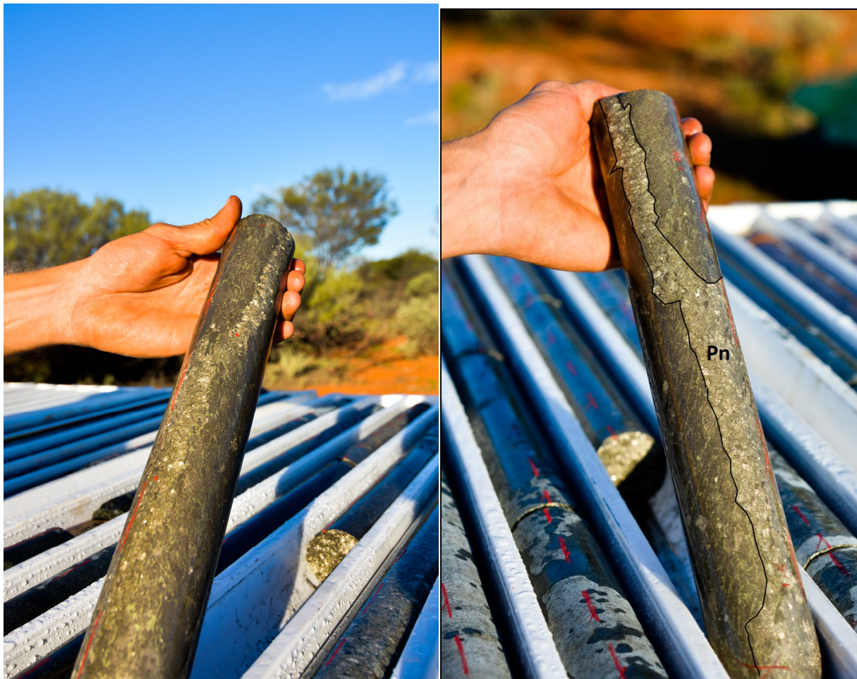
Figure 1 – photograph of drill core from MAD31 showing the pentlandite vein (outlined and labelled Pn in photo on left) that returned 28%Ni (based on XRF analysis) within the massive nickel-copper sulphide interval from 112.05-113.08.

“The successful drilling by St George has significantly expanded the size of the high grade nickel-copper system in the Cathedrals Belt and established Mt Alexander as a new and significant nickel sulphide project in Western Australia.”