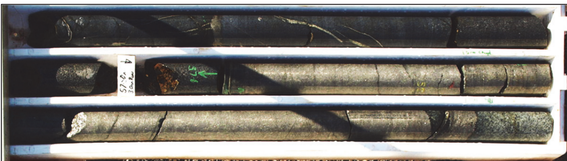
Figure 2 – high grade nickel-copper sulphides in komatiite ultramafic on contact with granite in MAD13