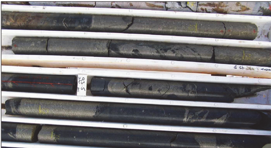
Figure 1 – high grade nickel-copper sulphides in komatiite ultramafic in MAD12

The Cathedrals Fault that hosts the mineralised komatiites remains largely untested along strike from the Cathedrals Prospect.