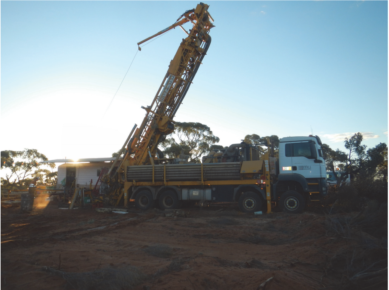
Figure 1 – drill rig at Aphrodite nickel sulphide prospect

The drill hole has been cased in PVC-piping and a DHEM survey will be completed to test for further EM conductors, which may represent nickel sulphide mineralisation, laterally or at depth. The strong EM response from the Aphrodite 4 plate may have prevented the surface EM survey from detecting any additional EM responses from nearby nickel sulphide accumulations.