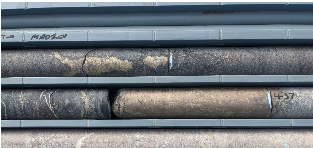
Figure 1 – drill core from the mineralised interval in MAD201 showing massive sulphides as well as stringer and disseminated sulphides.

* Laboratory assays are pending and are required to confirm the nickel and copper grades which have been estimated using portable XRF analysis