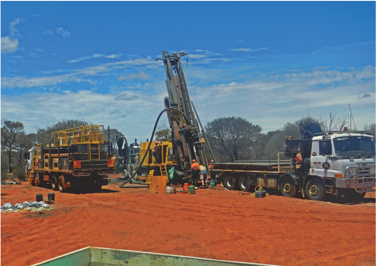
Figure 2 – photograph of RC rig at the Oxford prospect