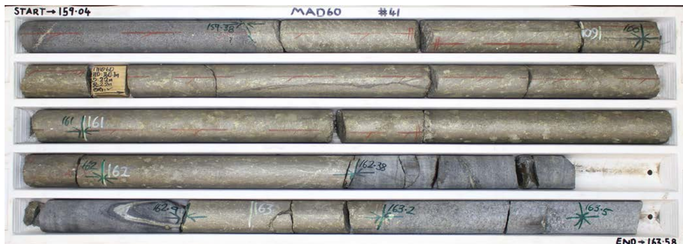
Figure 2 – photograph of drill core from MAD60 between 159.04m to 163.58m showing thick massive nickel-copper sulphides which included 3m @ 6.40%Ni, 3.55%Cu, 0.21%Co and 5.25g/t total PGEs from 159.38m