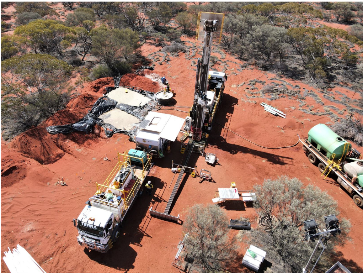
Figure 3 – diamond drilling underway at Mt Alexander.