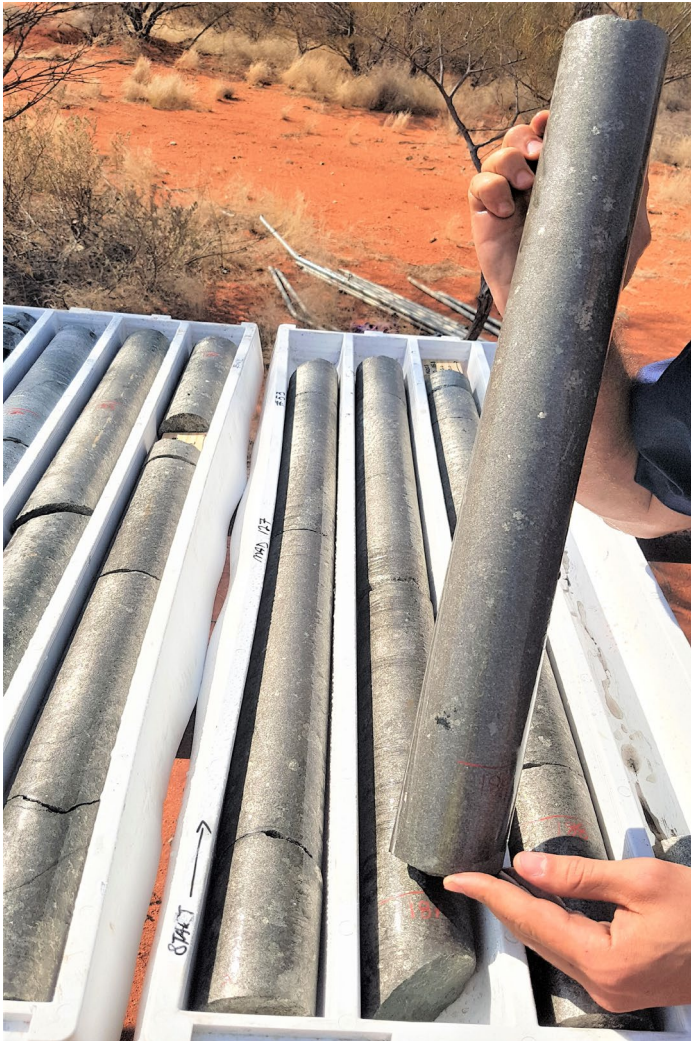
Figure 1 (left) – drill core from MAD127 at Investigators, one of multiple thick high-grade nickel-copper sulphide intersections already achieved at Investigators.

MAD127 returned assays of 8.49m @ 5.78% Ni, 2.64% Cu, 0.18% Co and 3.61g/t total PGEs from 183.9m.