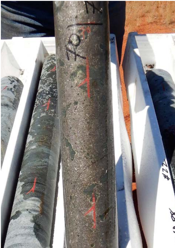
Figure 1 – drill core from MAD88 with massive sulphides at approx. 70m downhole with spot XRF values of 6.7%Ni and 1.9%Cu

Nickel and copper values shown above and below are based on portable XRF analysis. A conclusive determination of the nickel, copper, cobalt and PGE values of the sulphide mineralisation will be confirmed when laboratory assays are available.