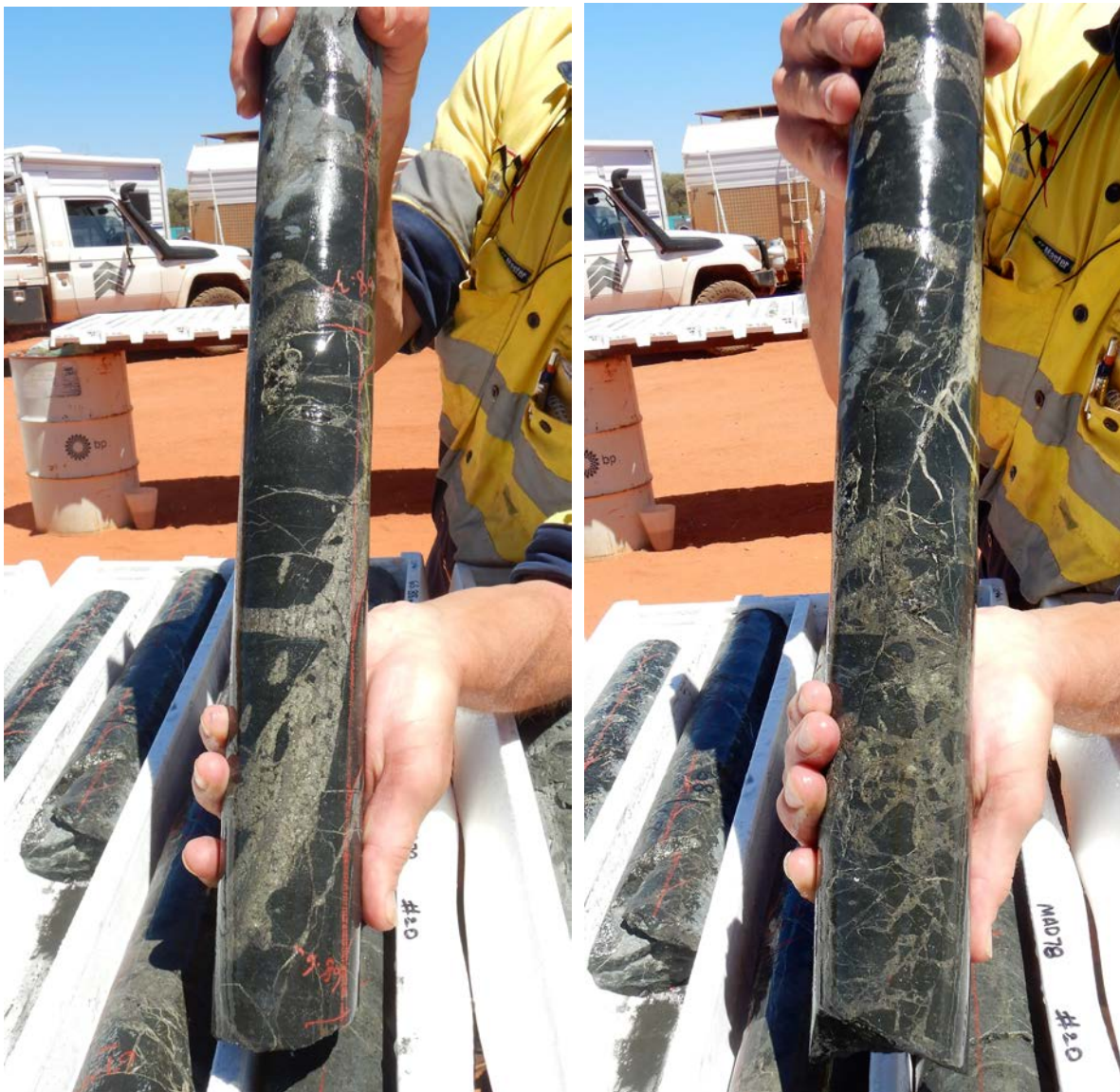
Figure 3 – photos of drill core in MAD78 (from 66.6 – 68.8m); nickel-copper sulphides in breccia highlight the influence of structures in the distribution of mineralisation.